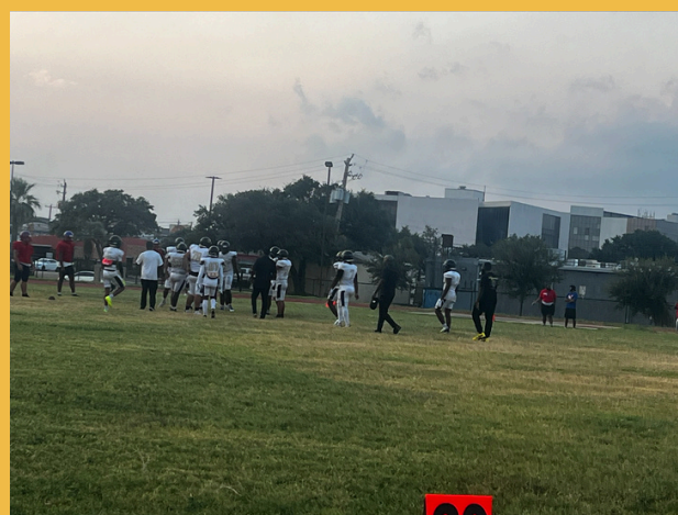
Wisdom High School Football Team wins first home scrimmage 28-0